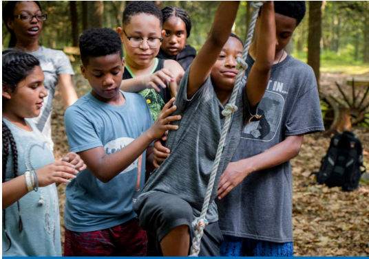
2019-2020 Presbyterian Planning Calendar