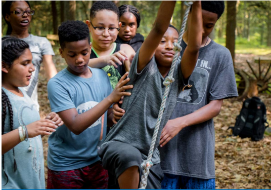
2019-2020 Presbyterian Planning Calendar