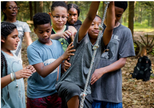
2019-2020 Presbyterian Planning Calendar