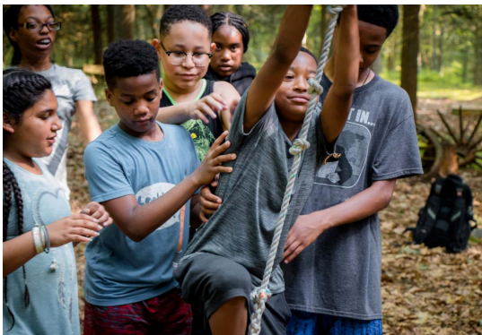
2019-2020 Presbyterian Planning Calendar