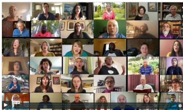
Image above: A choir of 38 International Peacemakers was gathered by the Presbyterian Peacemaking Program to share a rendition of the hymn "This is My Song." (Screen shot)