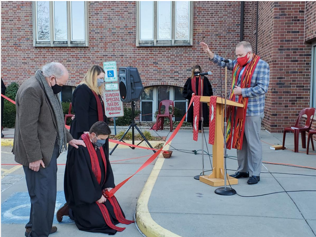
NWC&CV Committee's "Hope for the Journey Ahead"